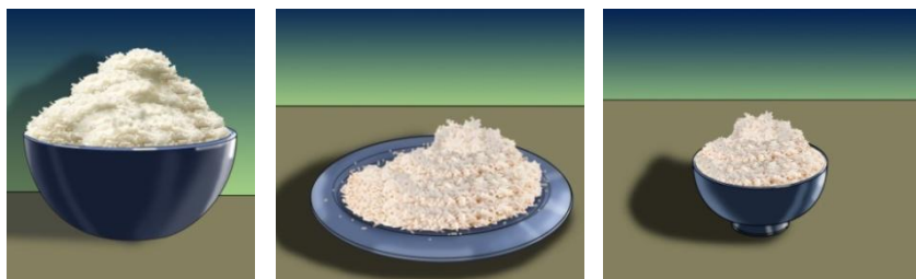
Figure 9.1 Amount of rice in bowl in the past (left), in plate at present (middle) and in pot in future (right).

Now the question is how to reduce the intake of arsenic through rice. There may be some suggestions. For example, three to four decades ago Bangladeshi preferred to eat bowl full rice (Figure 9.1). Now-a-days they prefer to eat plateful rice. In order to reduce the arsenic load, they should take potful rice. Total arsenic content of raw rice may be reduced 35 to 45% in cooked rice after rinse washing of raw rice and cook with high volume (6: 1, water: rice) of water (Raab et al., 2009). It may be adviceable to rinse rice in water until water runs clear. Then cook rice in excess water than usual. The diet should not be consumed every day. If possible, in the individual diet, rice should not be included every day. Everything depends on the motivation of people.